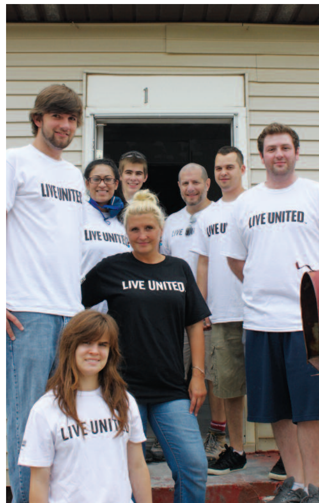
SINCE SUPERSTORM SANDY, MICROSOFT EMPLOYEES HAVE PARTNERED WITH UNITED WAY OF MONMOUTH COUNTY TO VOLUNTEER FOR "DAYS OF CARING," HELPING TO RESTORE HOMES IN SHORE TOWNS HARDEST HIT BY THE STORM.

To Live United means to stand united with your community to create a sum greater than its parts. By working with United Way on projects like our rebuilding efforts and the Warmest Wishes drive, we are serving the community where we work and live. In doing so, we can all make a direct impact and help each other build lives of greater opportunity and promise.