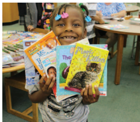
PICTURED ABOVE THIS SUMMER, [HOW MANY] CHILDREN HAVE BENEFITED FROM OUR EARLY GRADE READING PROGRAM, WHICH HELPS PREVENT THE SUMMER SLIDE THROUGH READING AND ENRICHMENT ACTIVITIES.